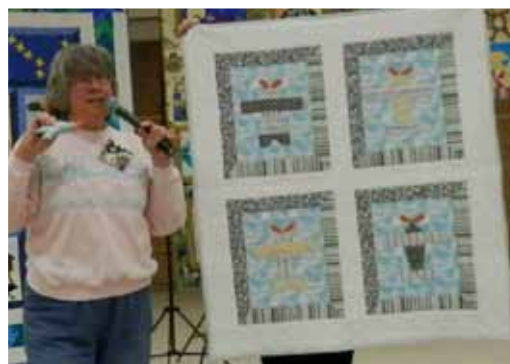
Can you see the toy airplane to match the child's quilt? Such a clever idea!